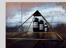
Ormus Face Oil

Contains: Ormus concentrate, Jojoba, Peach, Apricot, Argon, Rosehip, Acai, Red Raspberry, Sea Buckthorn, Tamanu, Macadamia, Evening Primrose, Pomegranate, Sandalwood, Rose Geranium, White Lotus and Neroli Oils.