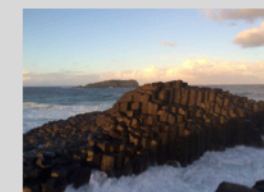
Hexagonal pillars in the Ocean